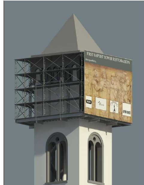
SCRIM IN RELATION TO WORKING PLATFORM (Scrim will actually be on all four sides)